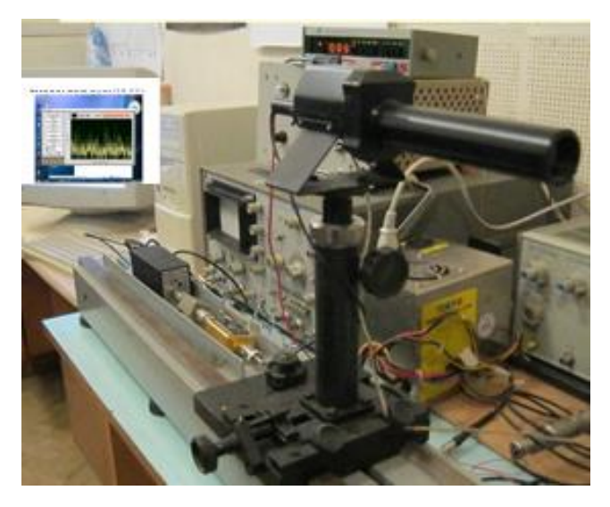
Figure 1. Mockup of on-board ultraviolet polarimeter at the stand

A special bench to set up and study the current prototype of the UVP, its individual blocks and their combination, was developed in [2] (see Fig. 1). It can be divided into the separate interchangeable parts, units and blocks.