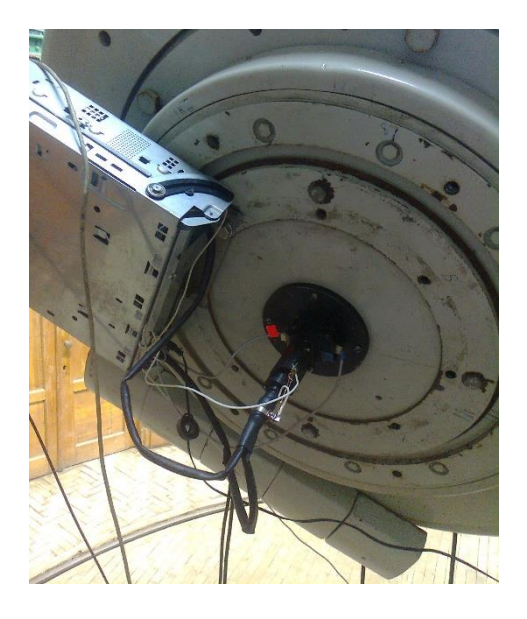
Figure 2. Ultraviolet polarimeter at the AZT-2 telescope.

selected the sky region using a diaphragm with a diameter of 0.5 mm.